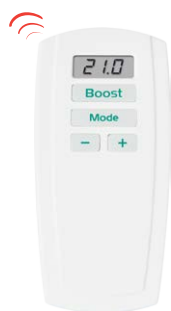
Optional IR remote control