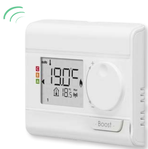
Optional RF remote control