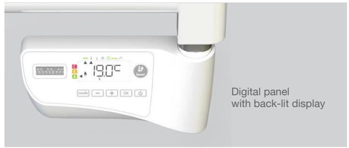
Digital panel with back-lit display