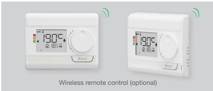
Wireless remote control (optional)