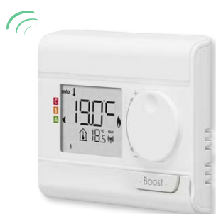
Optional RF remote control