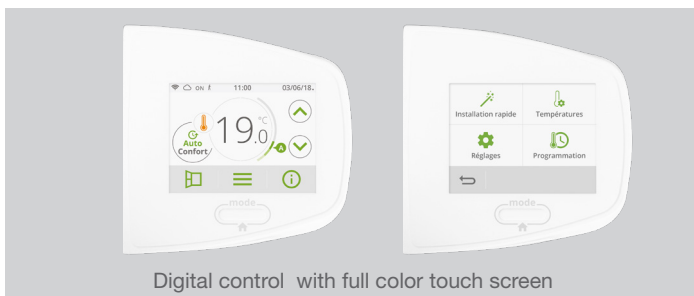
Digital control with full color touch screen