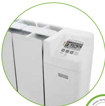
Version with occupancy detection