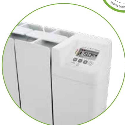
Version without occupancy detection