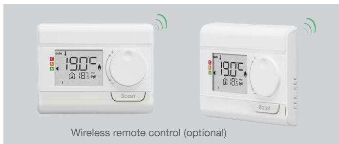
Wireless remote control (optional)