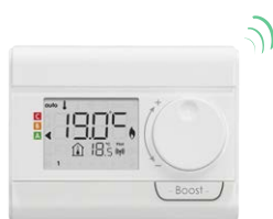
Optional RF remote control