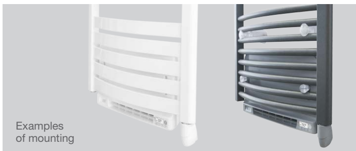
Examples of mounting