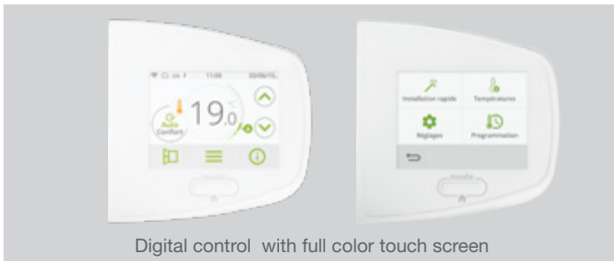
Digital control with full color touch screen